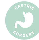
Gastrectomy Gastric bypass