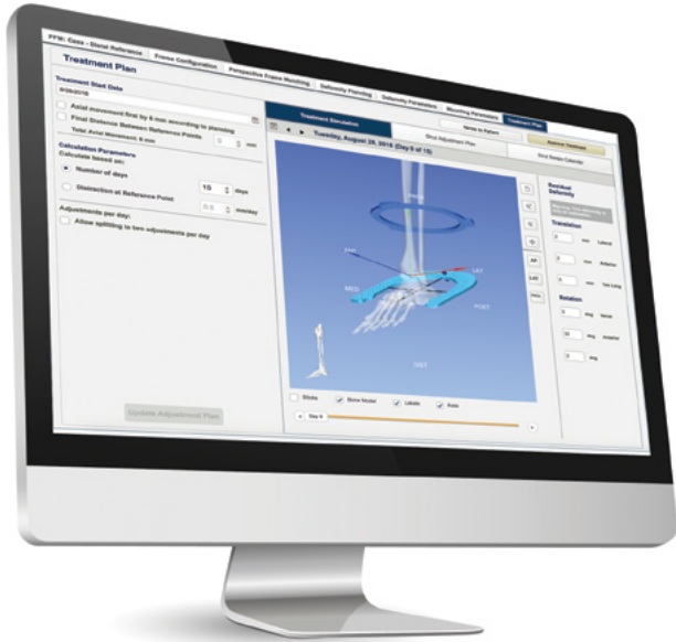
The MAXFRAME System 3D Software features Perspective Frame Matching (PFM) technology

Hardware supports static frame bone reduction and simplifies patient treatment plan adjustments if utilized in conjunction with software.