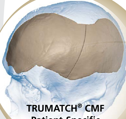
TRUMATCH® CMF Patient-Specific Implants