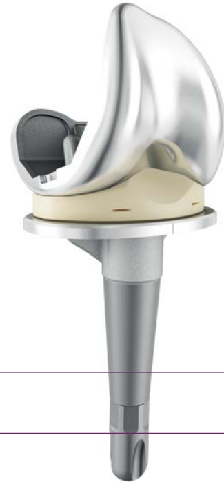
ATTUNE Primary Knee System

Breakthrough discoveries and proprietary technologies, clinically designed to address patient needs for stability and motion 1