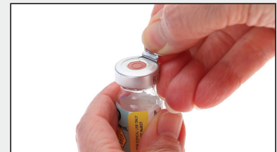
2. Pull Tab