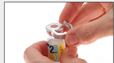
3. Remove Ring