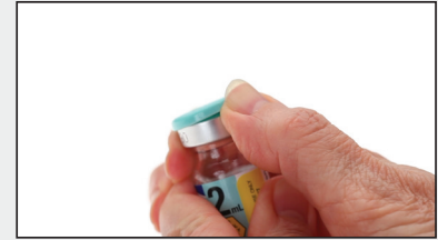
1. Remove flip-off plastic cap